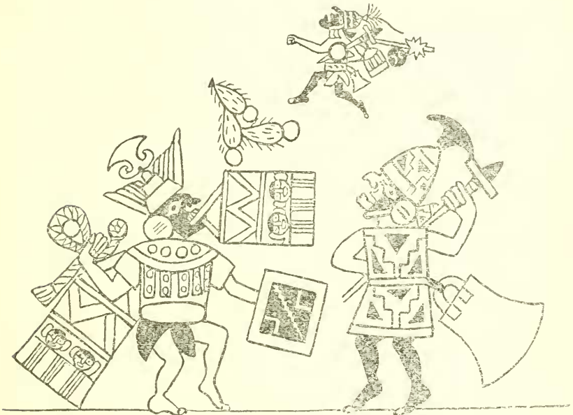
FIG. 2.—BATTLE SCENE SHOWING USE OF SLING.

In the Chimu region, where many realistically painted vessels have been found, vase paintings showing combats in which slings are being used occur. 2 Figures 1 and 2 show two of the most interesting battle scenes painted on pre-Inca vessels from the neighborhood of Trujillo. The slings are not depicted in detail, but they are unmistakable.